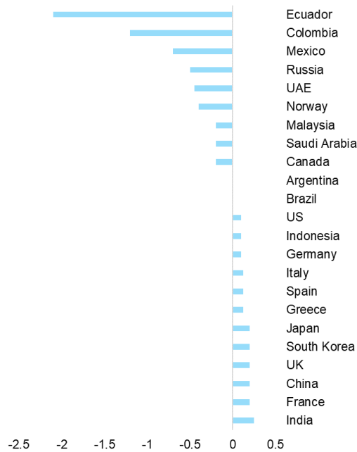
Figure 1 - Impact on GDP growth after 1 year from a permanent decrease in oil price of USD10bbl

Gross external financing requirement is defined as the sum of the current account balance and the external debt maturing within the next 12 months. In Bahrain this amounts to 180% of all FX assets held by its central bank and the SWF (see Figure 3), reflecting that the sovereign or companies could quickly face problems repaying debt in the event that external financing becomes more difficult. In Oman and Kazakhstan the corresponding ratios look more comfortable, at about 50%. However, it should be noted that Kazakhstan's foreign assets comprise just USD10bn in official FX reserves and USD61bn held by its SWF. In the past, the country has been reluctant to use SWF assets in order to rescue its ailing banking sector. Hence, there is also a risk that rolling over external debt will become difficult especially for private-sector companies in Kazakhstan.