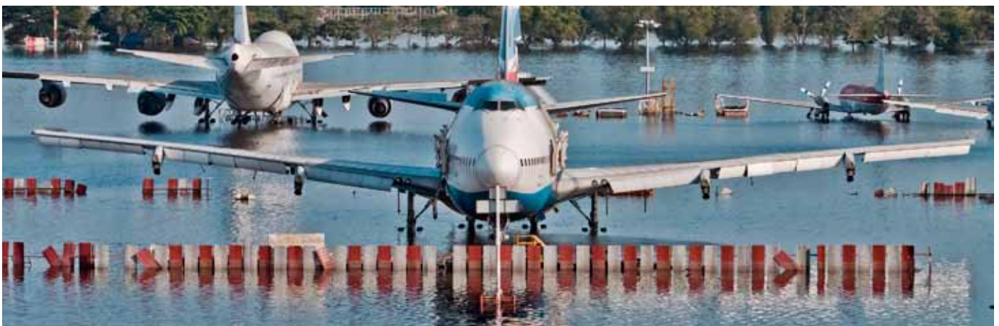
Airplanes drown in the water at Don Muang International Airport during the massive flood crisis on November 16, 2011 in Bangkok, Thailand.

In 2011, contingent business interruption claims, arising from natural catastrophes (whereby a supplier failure in one country can have a