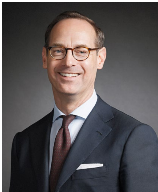
OLIVER BÄTE Chairman of the Board of Management